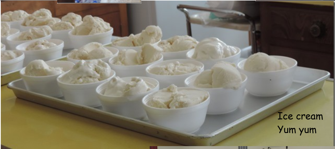
Ice cream Yum yum