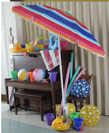
Social Room Cleverly Decorated Some of the Attendees